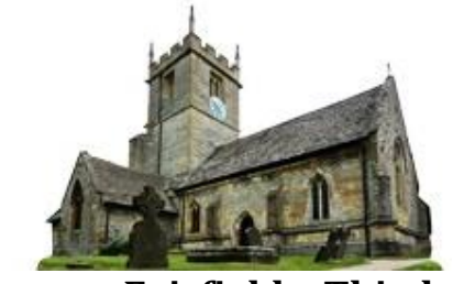
Hampton - Fairfield - Thistledown Eastwick Park - Charity Crescent